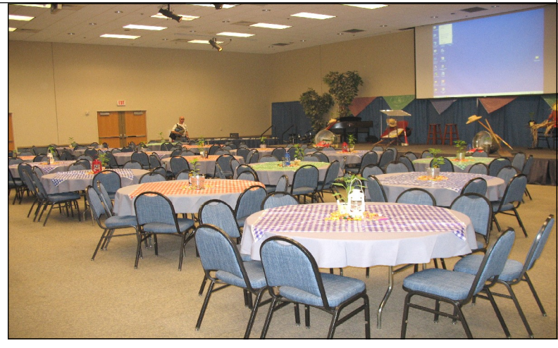
Final preparations for a Lake Hart-wide Training on April 13th